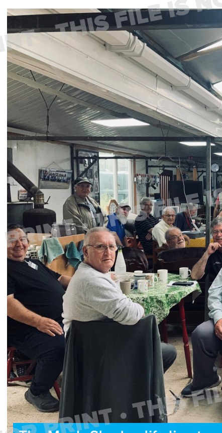
The Men's Shed- a life line to s

If you would like to discuss any further ideas that you think may help to keep our area clean and tidy please contact me and I would be delighted to hear them and discuss them further.