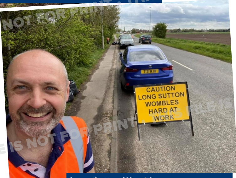
Long Sutton Wombles