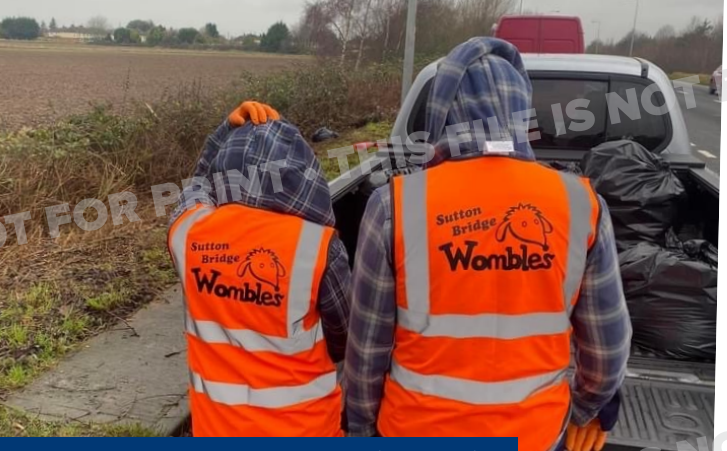
Wombles collected over Christmas Sutton Bridge

Santa's sleigh-getting ready for an evening visiting the local children