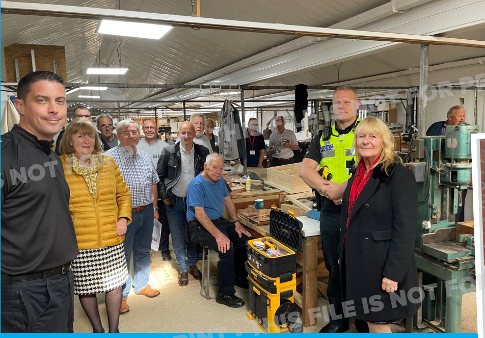
Great Support for my Youth Shed project from the police, colleagues and the fabulous Mens Shed volunteers